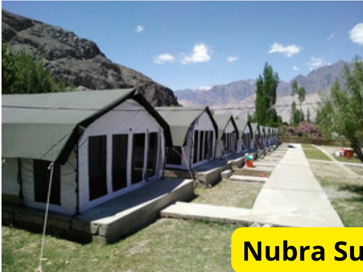
Nubra Summer Camp