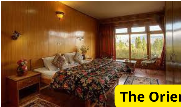
The Oriental Ladakh