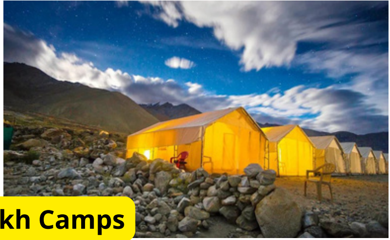
The Ladakh Camps