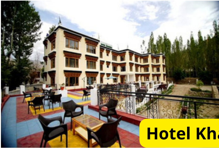
Hotel Khaksal Chubi