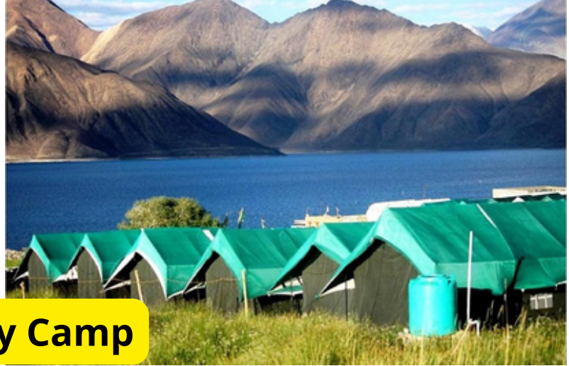
100 Sky Camp