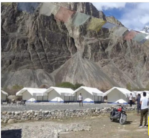
Valley View Camps